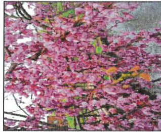
Buchanan, MI Redbud City